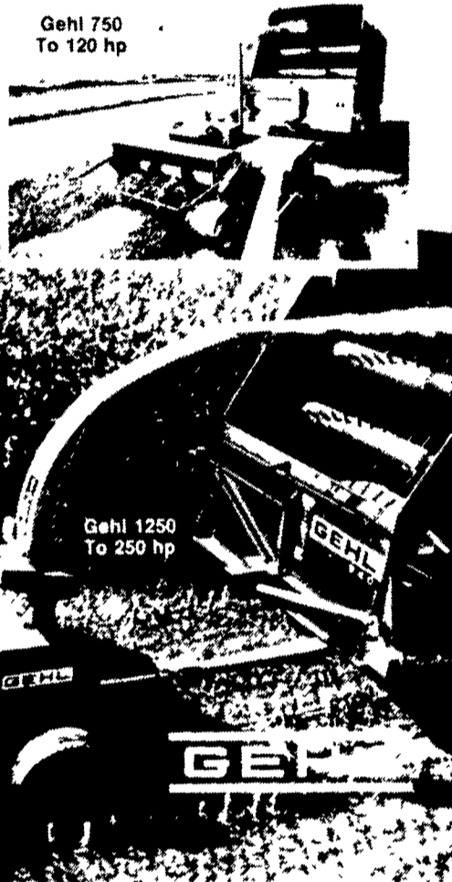
Gehl 1250 To 250 hp