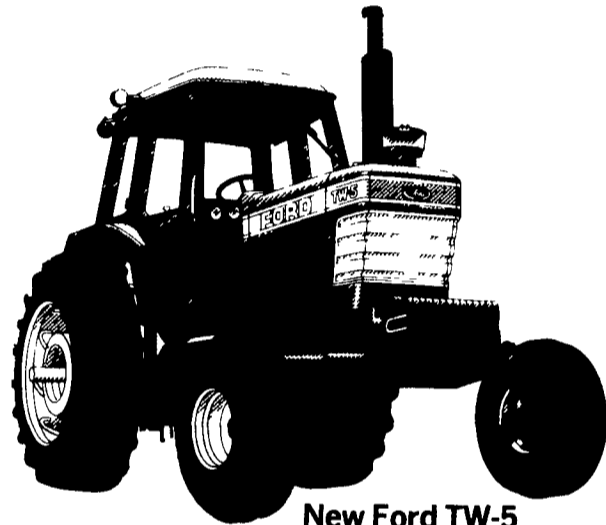
New Ford TW-5

Example of a lease-purchase transaction, not necessarily for a particular Ford tractor or for your transaction