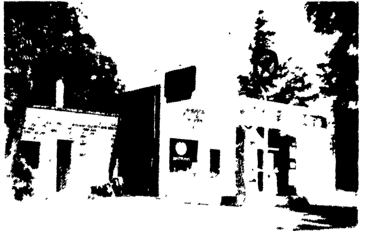
Starting as Miller Brothers auto garage, Springs Equipment, Inc. soon became an Allis Chalmers dealer and has been serving farmers with their equipment for 43 years.