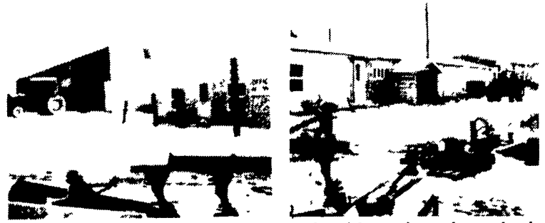
Located in Honesdale, Marshall Machinery is an important A-C supplier to northeast Pa. farmers.

Marshall's Annual Inventory Reduction Sale has become a major agricultural event, attracting customers from the eastern and southern states, as well as Canada. Scheduled each year for the first Saturday in April, this year's sale will begin at 9:30 a.m. on April 7.