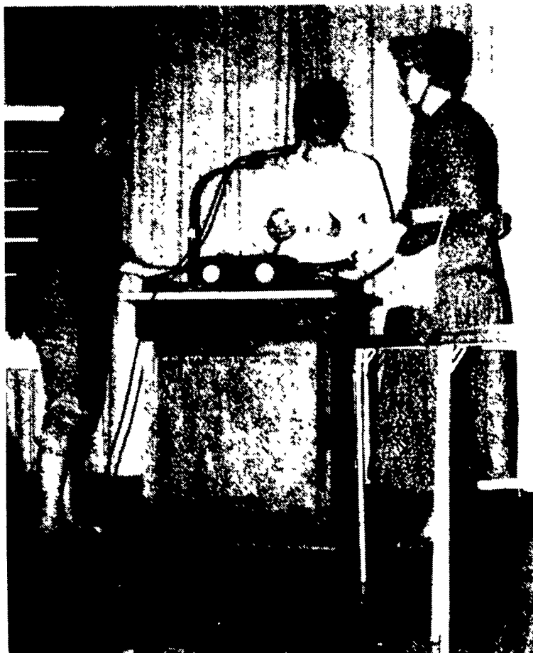
Farmers wives pair off for their turn at the questions during a Family Feud game during the Berks Co. 4-H Dairy Banquet.