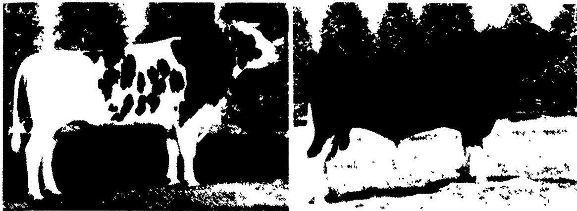
Maplebound Starlight Rex, left, and Tri-Town Shadow Flash are now on the proven roster at Select Sires.