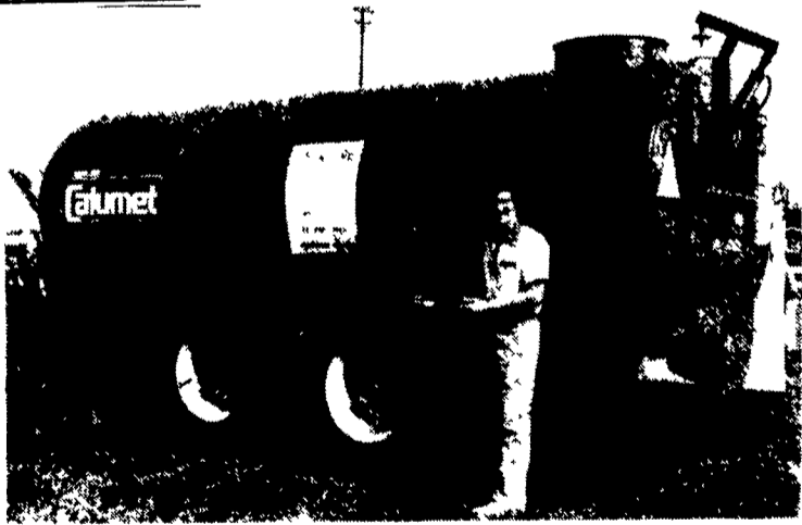
Dean Snook is shown above with the new Calumet 3750 gal. tank.