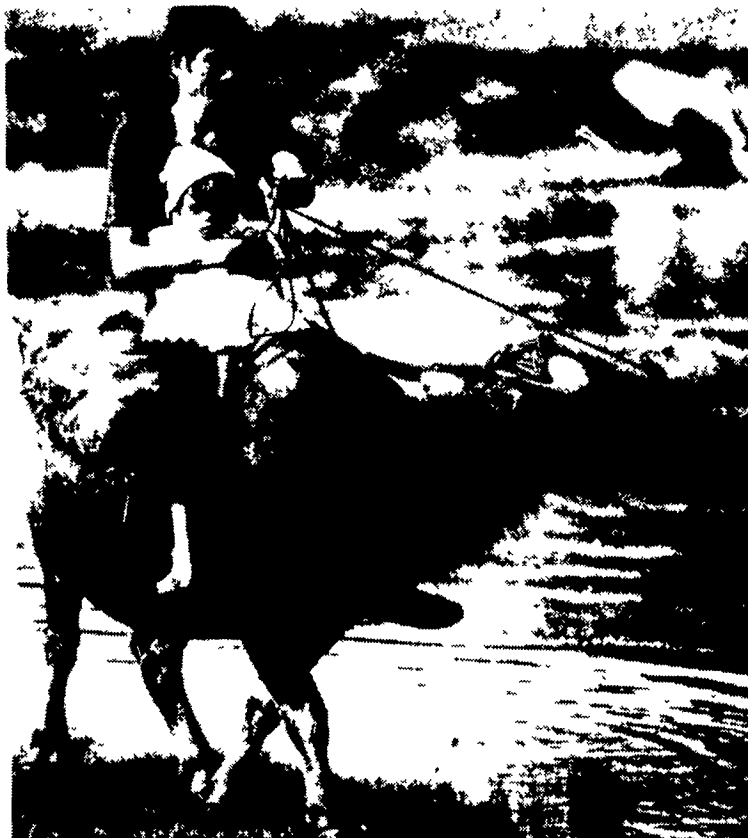
Father and daughter hitch a ride on a water buffalo in the wetlands of Malaysia. One of the gentlest of farm animals, the water buffalo is an important source of milk, cheese, and meat in many parts of the world. It also serves as a "tractor" by pulling heavy loads. Small herds thrive in Arkansas, Louisiana, and Texas.

People have depended on water buffaloes for centuries. Their crescent horns, coarse skin, wide muzzles, and low-carried heads are depicted on seals struck in the Indus Valley 5,000 years ago.