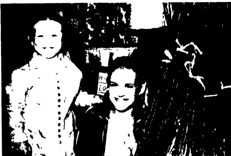
Tree seedling sales are now under way in the Lancaster and Dauphin County Conservation Districts.

The deadline for placing pre-paid orders in Lancaster is Friday, March 23. Pickup date is Friday, April 13.