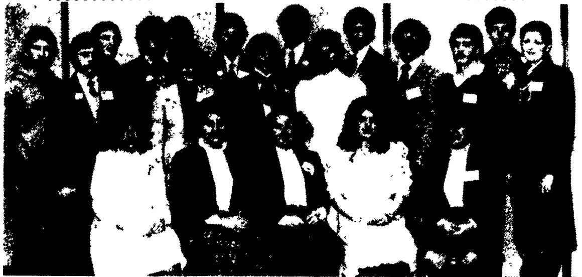
Executive members of the Pa. Holstein Junior Association met during the Altoona Convention to finalize plans for 1984 programs.