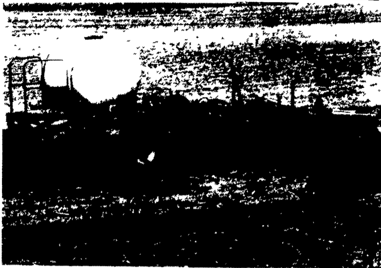
New SpraCart from Deere permits spraying in conjunction with tillage.

The 250 SpraCart Sprayer is compatible with the 722 Mulch Finisher, 940 S-Tine Field Cultivator, and 1010 and 1050 Field Cultivators.