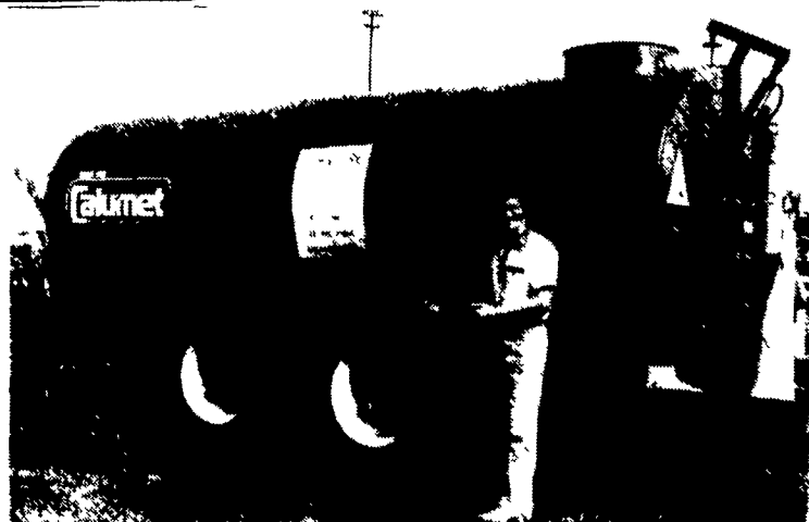
Dean Snook is shown above with the new Calumet 3750 gal. tank.