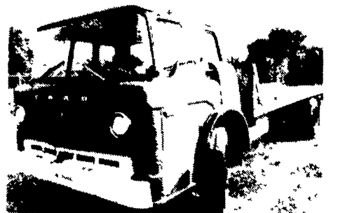
1973 C600, New 391 Engine, 26 ft Bed, 5 Speed w/2 Speed Rear