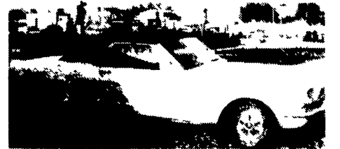
1966 6 Cyl. Convertible