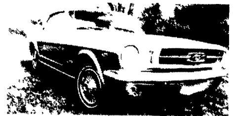
1965 289 Convertible

Lancaster Ford Tractor offers a large selection of Allied Equipment.