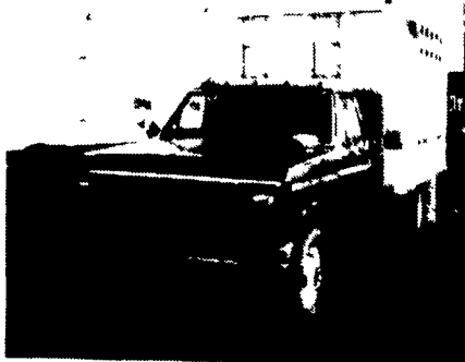
FORD F350 Diesel or Gas