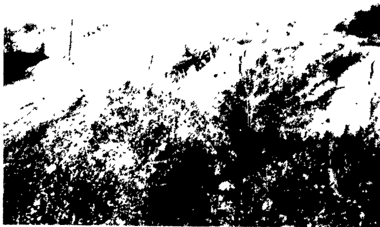
"Before" photograph shows the Kemmer site, Clarion County. Before reclamation, site contained an open mine shaft, collapsed buildings, and eroding waste materials.

collapsed buildings, and burning, eroding culm banks improves local property values and the quality of life. This means a lot to people." Land is reclaimed for use as cropland, pasture, woodland, wildlife, or recreation. RAMP is a voluntary program which deals with small areas of abandoned coal mine land in private ownership. Over 700 Pennsylvania landowners have applied for reclamation help on 14, 399 acres. The decision on which land will receive treatment is based on safety and health hazards and community benefits and is made by county and State RAMP citizen and agency com-