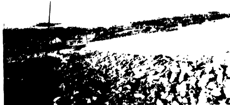
"After" photograph of the Kemmer site. Mine shaft has been closed, collapsed buildings removed, and eroding land stabilized by grading, seeding, and a rock-lined water runoff channel.