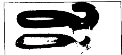
Heavy-duty link (top) and extra heavy-duty link (bottom) for long chains and heavy loads