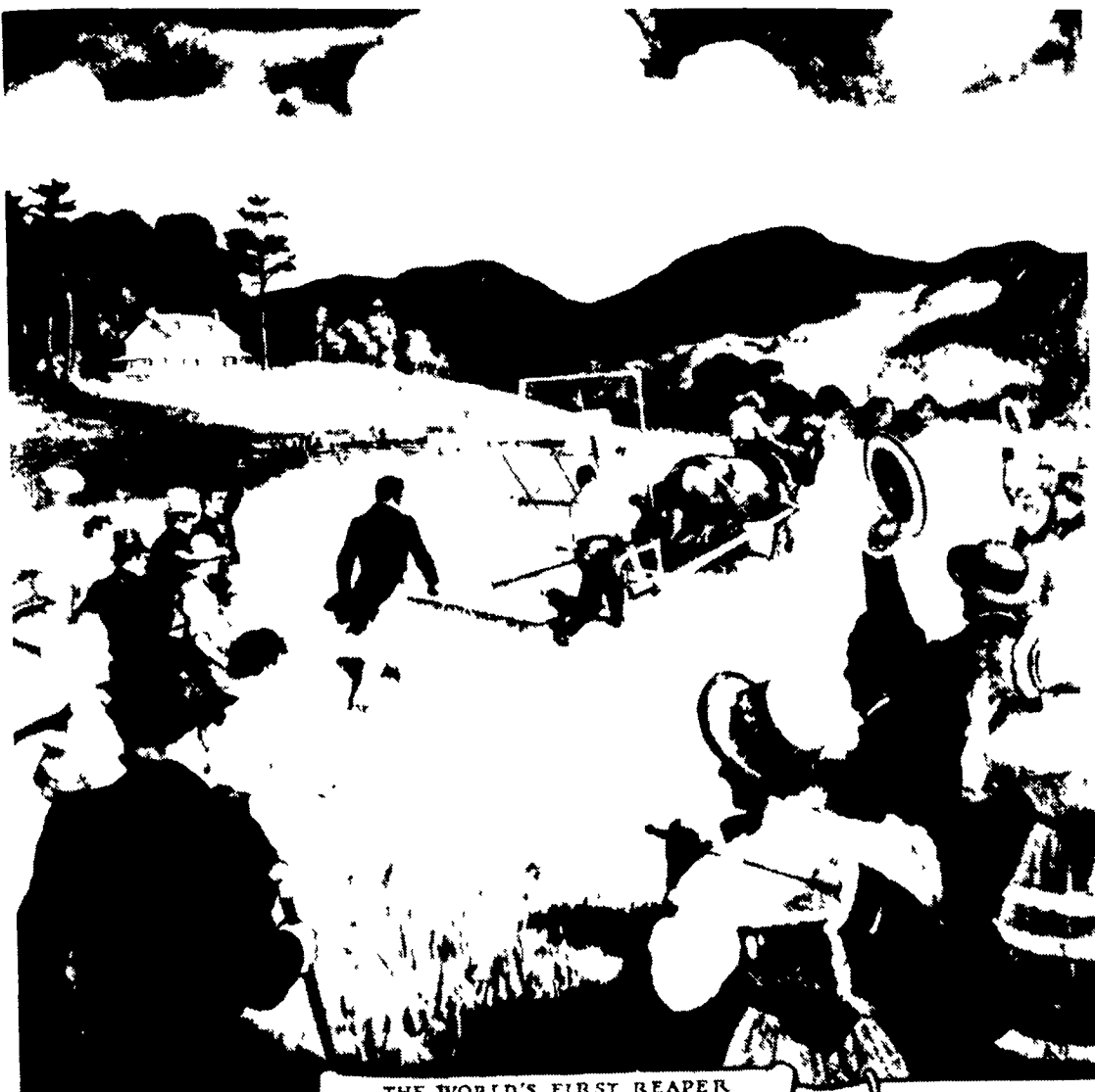
THE WORLD'S FIRST REAPER Public Test of Cyrus Hall McCormick's Invention Steeles Tavern, Virginia, July 1831

The 90 horsepower model 3288 30 Series tractor shown above is powered by an IH 358 cubic inch naturally aspirated diesel engine. The 30 Series' easy shifting transmission has 16 forward and 8 reverse speeds operated with right hand controls. Completing the 30 Series line is a 113 horsepower model 3688 tractor, at 112 hp 3488 Hydro, and an 80 hp 3088 model, the four tractors in this series serve the U.S. 80-120 horsepower segment of the tractor market.