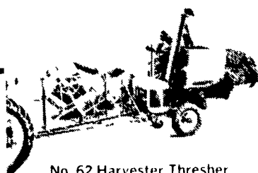
No. 62 Harvester Thresher (Engine Drive)