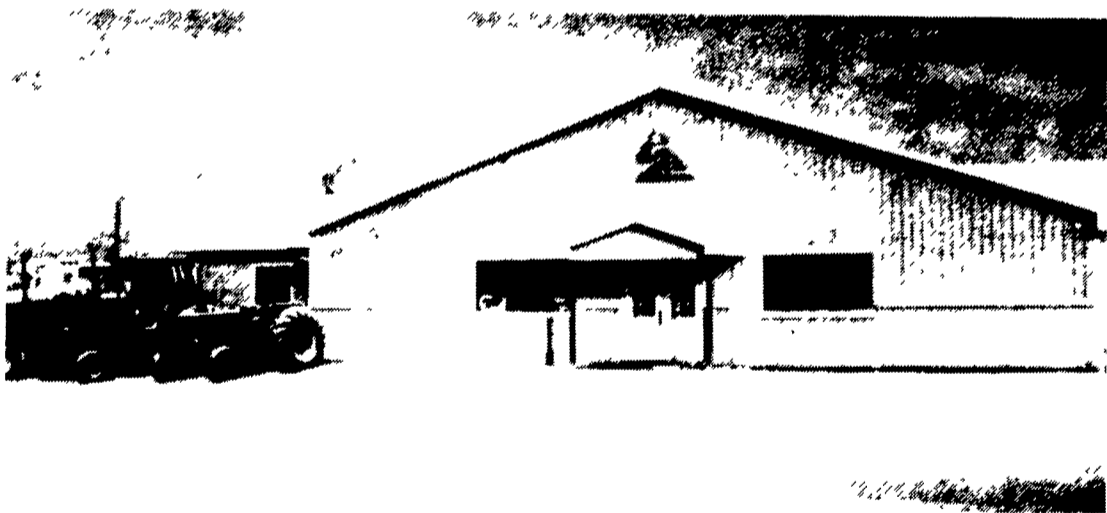
Swope and Bashore, Inc.'s floor space doubled with the erection of their new facility in 1978.