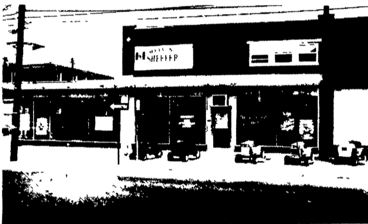
The purchase of this former auto dealership in 1982 permitted much needed expansion of Sheffer's showroom, service, and warehousing facilities.