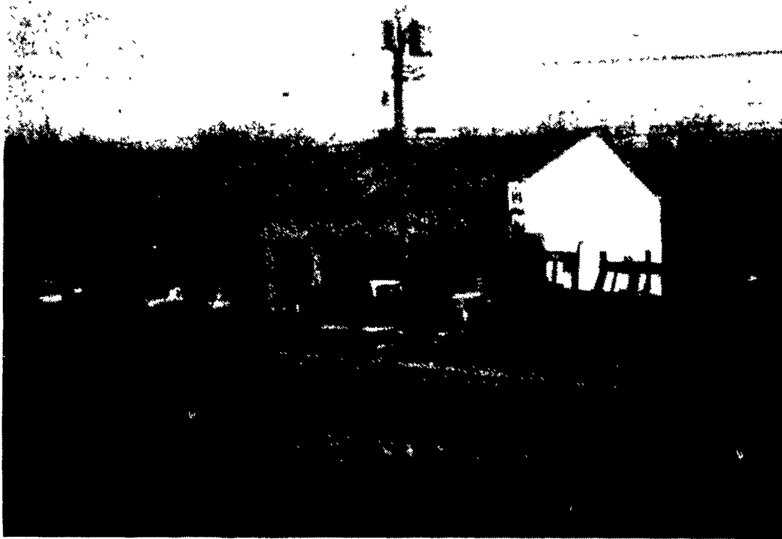
Located near PA's eastern border, Vough & Sons, of Bangor caters to many New York I.H. customers as well.

IH's 50 Series tractors were introduced in 1981, culminating a seven-year development program in which IH invested more than $200 million for research and capital improvements. The tractors were designed at the company's Agricultural Equipment Engineering Center in Hindsdale and are built at IH's Farmall plant in Rock Island.