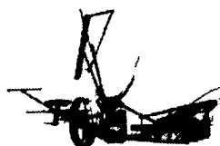
TYPE "L" REAPER