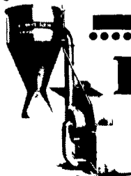
McCormick-Deering No. 6 Hammer Mill