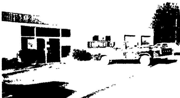
Inch Equipment Company, of McAlisterville, represents more than 40 years of I.H. sales and service in the Juniata valley.