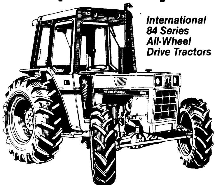
International 84 Series All-Wheel Drive Tractors

Get it all — increased pull power, improved productivity, maneuverability and economy with an International 84 Series all-wheel drive tractor. And they're available in five power sizes from 52.5 to 72.9 PTO hp. Look at the benefits.