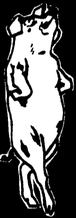
E-Z FLUSH Swine Waste Treatment Program

Tuesday Nite, January 31, 1984 at 7 P.M. Farm & Home Center (Section A), Arcadia Rd., Lancaster, PA