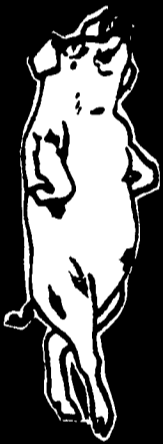
E-Z FLUSH Swine Waste Treatment Program

Are You Tired Of Spending Money For Products That Do Only Half As Good As You Were Told?