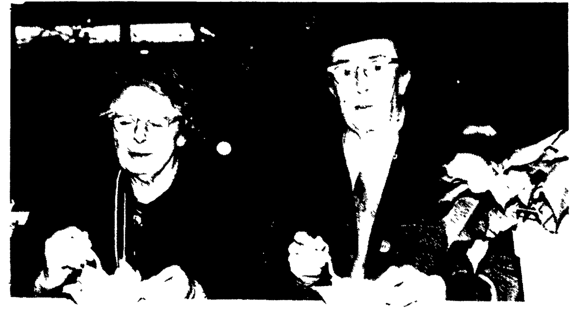
Two visitors to the Farm Show enjoy steamy, freshly baked potatoes.