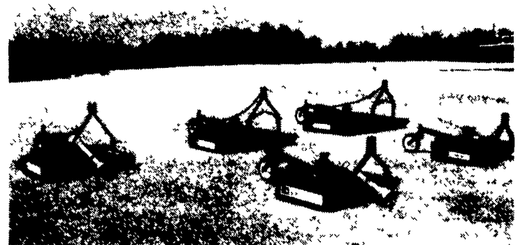
The Squealer Rotary Cutter line from Bush Hog includes five models of varying widths.

Alcohol can and will continue to be used as a fuel. However, precautions must be taken to ensure that engines are not damaged and satisfactory performance is had, especially if you do the modifications yourself.