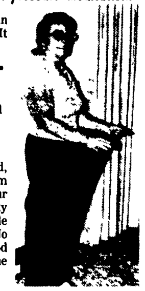
Donna Saul, August 1983

For more information concerning a FREE 30-day supply, and testimonies of relief from cellulite high blood pressure, heart problems, diabetes ulcers, digestion & female organ problems, cramps, allergies arthritis, depression, migraine headaches, nervousness and many others, contact