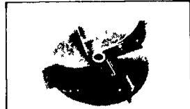
Adjustable Impeller Blades Four impellers blades adjust for close tolerance and efficient silage throwing.