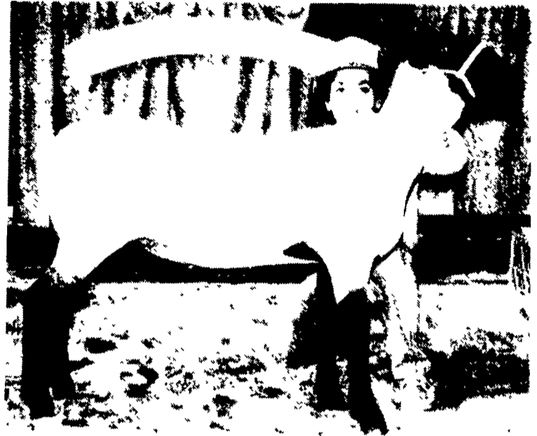
Garth Sweigard, R3 Halifax, with his junior market lamb reserve champion.