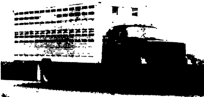
Aluminum Livestock Body

Manufacturer of ALL ALUMINUM TRUCK BODIES Livestock, Grain and Bulk Feed