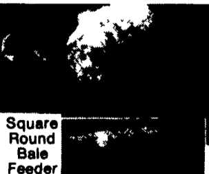
Square Round Bale Feeder