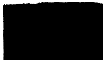
Easily Movable Trailer Bunk