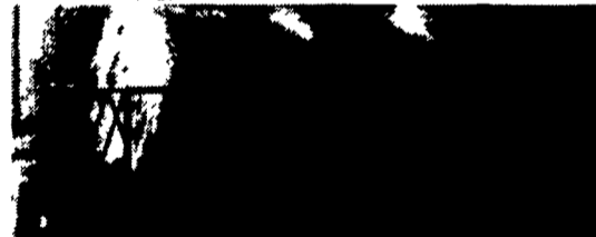
ALL PURPOSE FEEDER WAGONS