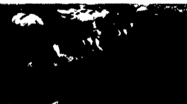
Full Sized Bunk