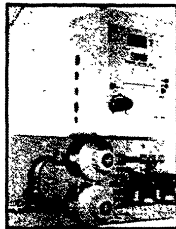
SunMaster™ (Auto Group Control Kit)

FEATURES ELECTRONIC IGNITION ELIMINATING: