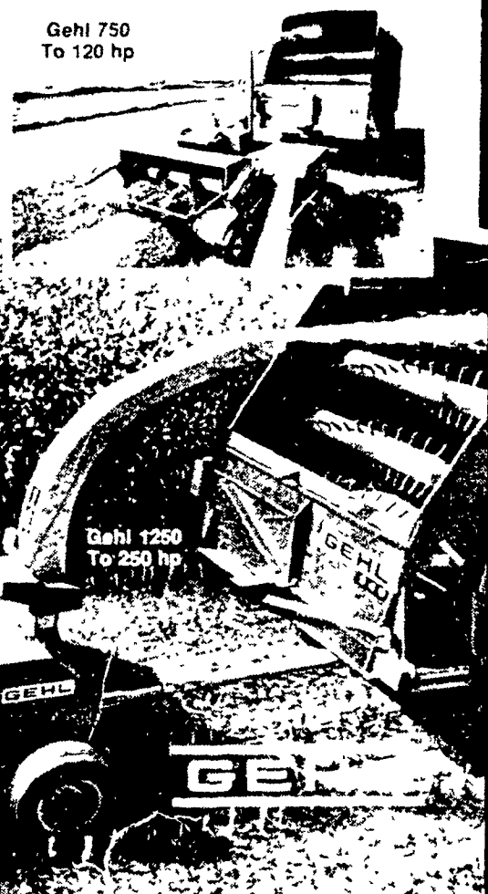
Gehl 750 To 120 hp

Gehl Company, West Bend, Wisconsin 53095