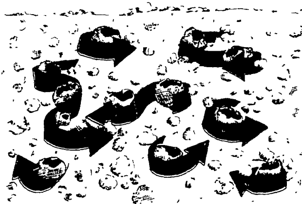
Bicep stays available and active in the soil solution

Greater solubility also makes Bicep readily available in the soil to be