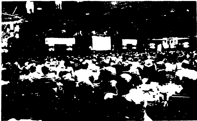
The Ninth North American Agricultural Lender's Conference sponsored by A. O. Smith Harvestore Products, Inc., featured general sessions on subjects of current interest to lenders as well as close encounter workshops on subjects such as use of micro-computers in lending and agri-business, cooperation between agri-business and ag lenders, operating farms for efficiency, and personal stress management.