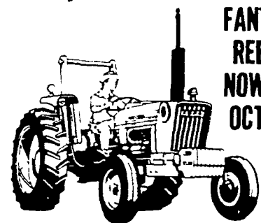
Ford 4600 Tractor

It's trade-in time at ALLEN H. MATZ, INC. or 10% OFF on all parts Used In A Major Overhaul