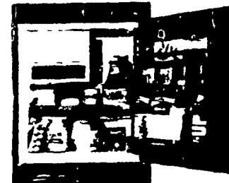
Model 1302 - The One With The Large Freezer

STOP IN WITH YOUR RV FOR AN ANNUAL MAINTENANCE CHECK-UP