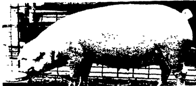
PSEUDORABIES FREE HERD #58 VALIDATED HERD #72 SALE TO BE HELD AT THE FARM RAIN OR SHINE

100 HEAD 35 BRED GILTS 50 OPEN GILTS READY TO BREED 15 BOARS READY FOR SERVICE FREE LUNCH - 5:00 P.M. to 6:30 P.M.