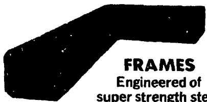
FRAMES Engineered of super strength steel tubing with cross braces and gussets at major stress points.