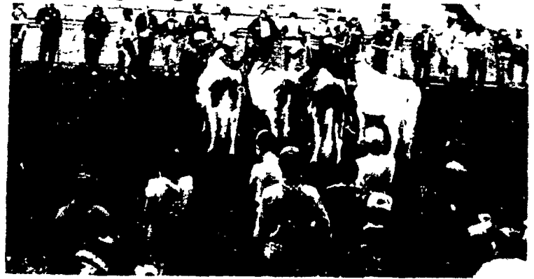
Youth from across the state tested their judging skills Tuesday in the Ninth Pennsylvania 4-H and FFA Dairy Judging Forum.