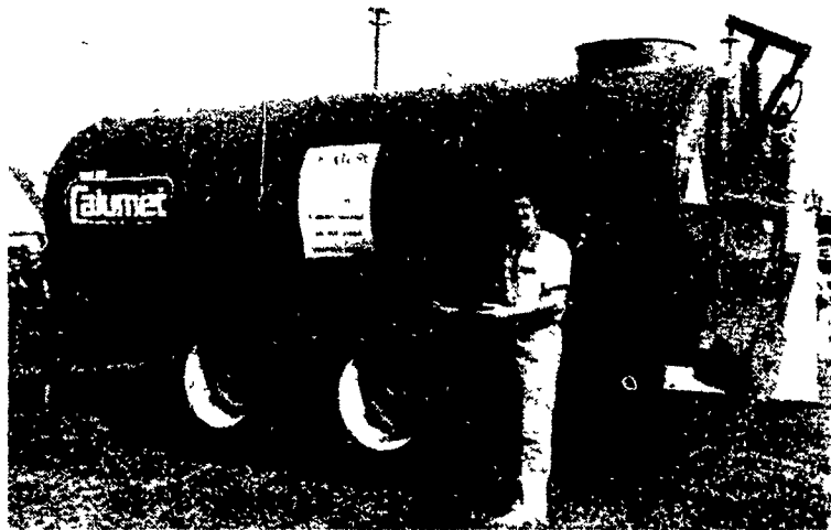
Dean Snook is shown above with the new Calumet 3750 gal. tank.

Features: • 4" Spindle • 4 wheel cab control brakes • 10 lug hubs • 18x22.5 16 ply truck tires