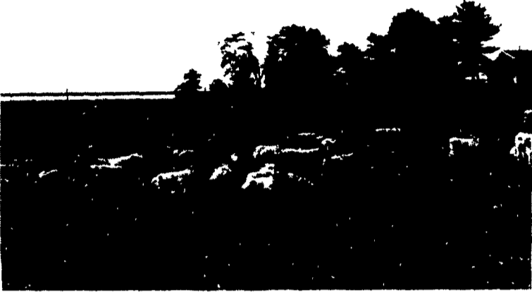
The Charolais offering at the J.C. Enterprises Oct. 22 sale will include many outstanding cows and calves from their stylish, prize-winning, well-bred herd.