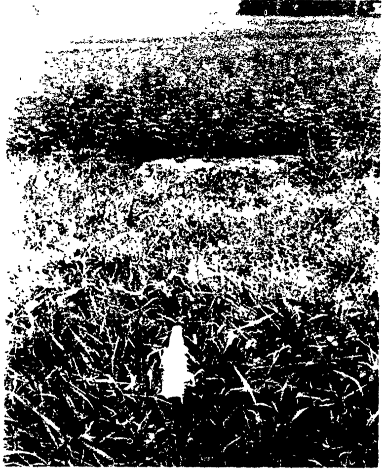
It's Miller time