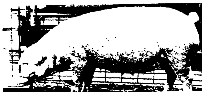
PSEUDORABIES FREE HERD #58 VALIDATED HERD #82 SALE TO BE HELD AT THE FARM RAIN OR SHINE

100 HEAD 35 BRED GILTS 50 OPEN GILTS READY TO BREED 15 BOARS READY FOR SERVICE FREE LUNCH - 5:00 P.M. to 6:30 P.M.