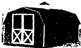
MINI BARN PRICES