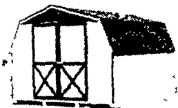
ECONOMY BARN PRICES