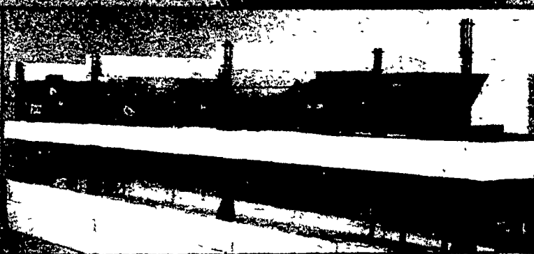
The Patz Belt Feeder moves feed fast in one direction while an innovative plow automatically distributes feed uniformly in the feed bunk.