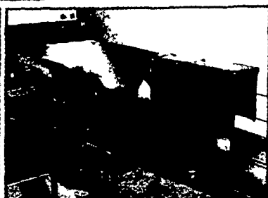
Plow reverses at each end of feeder automatically and smoothly with dependable continuous-loop drive cable. LF98F