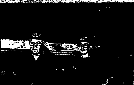
"The simplicity in design that produces reliable performance."