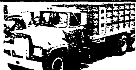
1969 MACK R-400, 5x2 Duplex, 48,000 GVW, w/new 19' Omaha standard grain dump