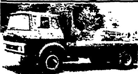
'75 GMC 6500, V-6 gas, 5 spd., w/new 17' Omaha Standard dump