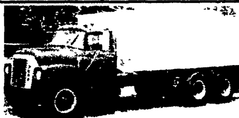
1975 IH, V-8 gas 13-spd., 43,000 GVW, w/new 18' aluminum grain dump