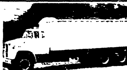
69 DODGE 900, V-8 gas, 3x5 trans., 53,000 GVW, w/new 20' Omaha Stand grain dump & roll tarp