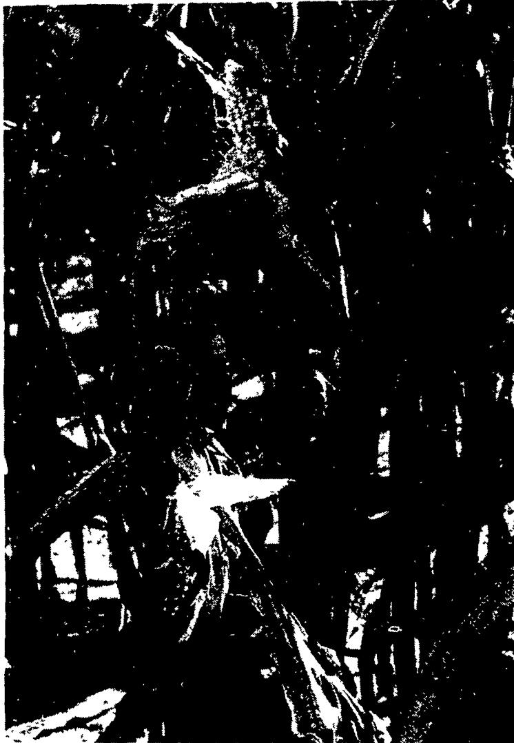
In some corn fields, the plants are not as stunted, but ears show little kernel development.

BY DICK ANGLESTEIN LANCASTER — It's corn chopping time — an annual benchmark in an agricultural year, particularly for a dairy farmer.