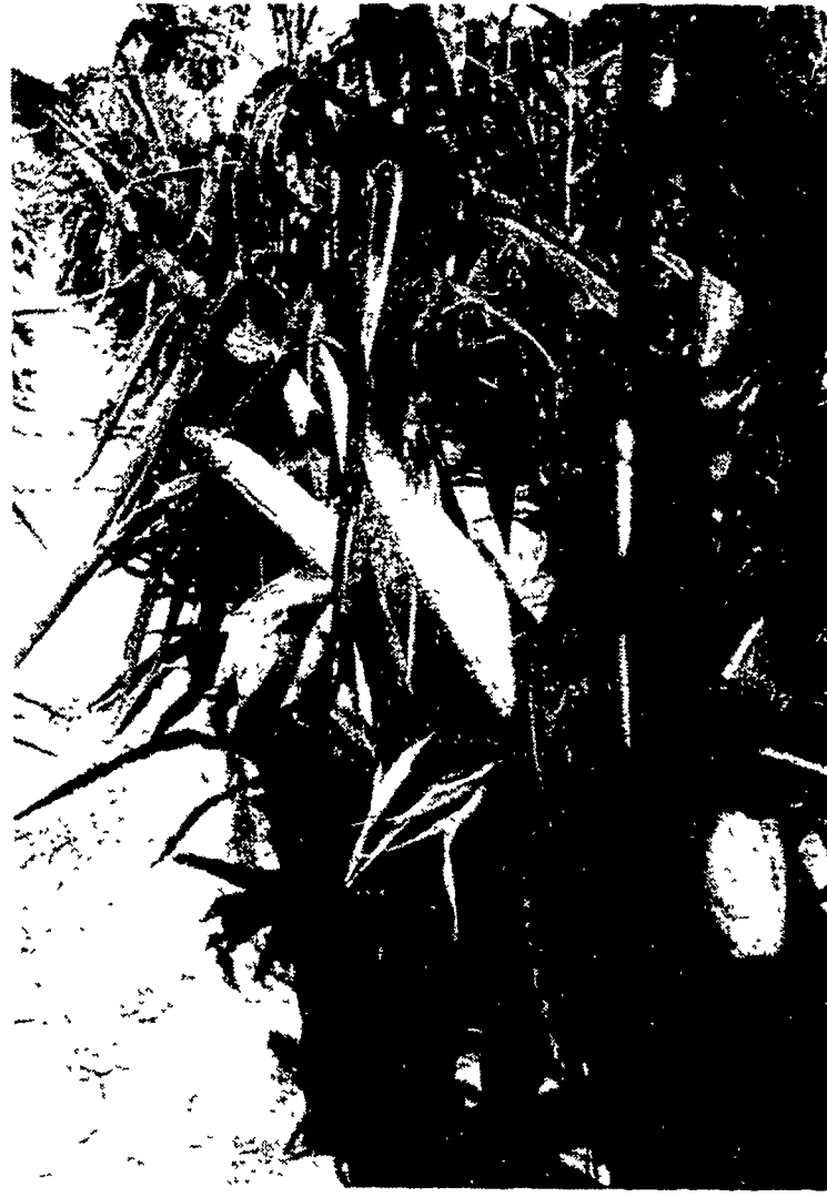
Other sections of fields have corn plants less than three feet tall, but ears show more normal kernel development.