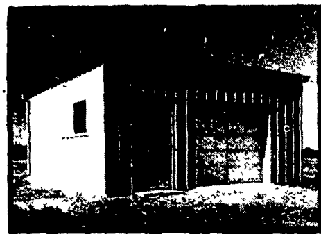
FARMSTEAD® II GARAGE