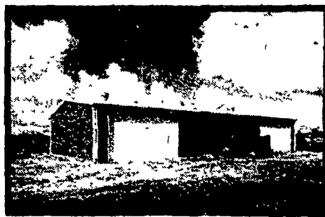
AG MASTER® 2:12