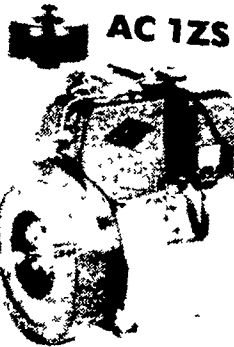
The Water Pump Diesel