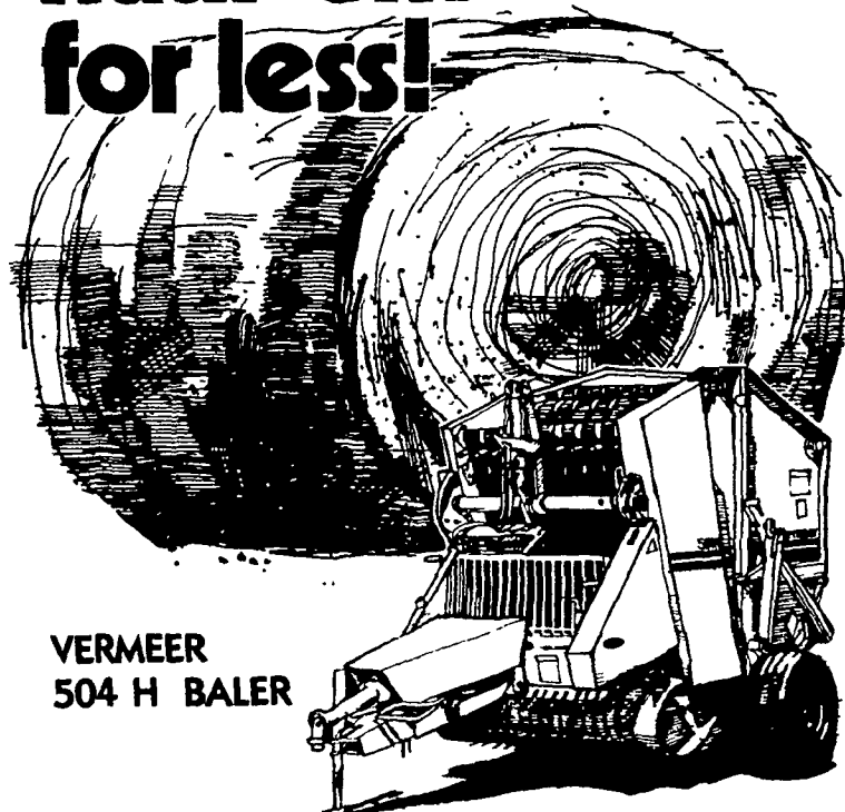
VERMEER 504 H BALER

Now... you can roll-em & haul-em for less!