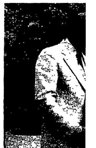
A Berks County 4-H high individual judge in Achievement Days.