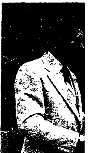
A Berks County 4-H high individual judge in H Achievement Days.