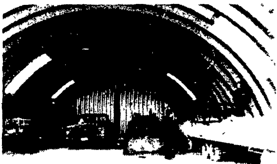
MACHINE STORAGE (High Sidewall Clearance) 40 x 64 (4 only)