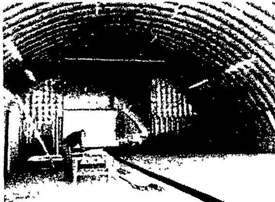
UTILITY BLDGS. (Easily Insulated) 25 x 48 (4 only)