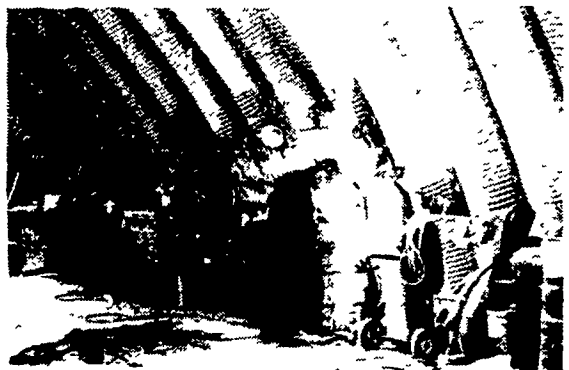
WORKSHOPS (No posts, beams or trusses) 47 x 80 (3 only)