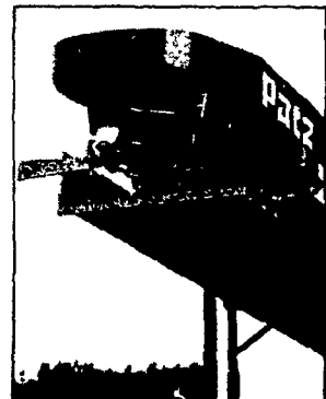
Patz Gutter Cleaner