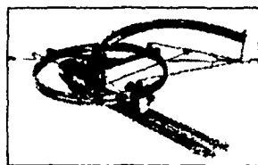
The RD-790 Ring-Drive Unloader